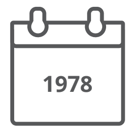
45 YEARS Rich history

Founded in 1978, RSP Architects has emerged as one of the country's most trusted, diverse and agile architecture and design firms. Our clients are a dynamic cross-section of established Fortune 100 global brands and retailers, innovative start-ups, thoughtful non-profits and institutions, and public entities.